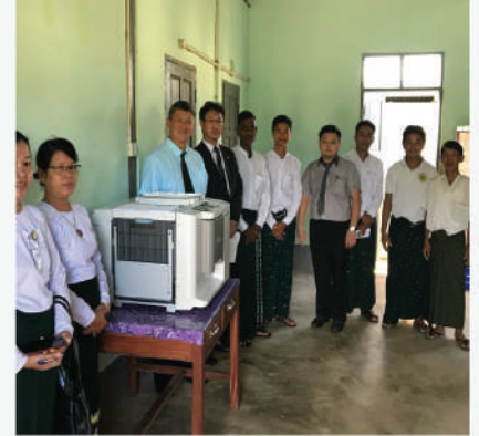
Visit to Education Office (Bago District)