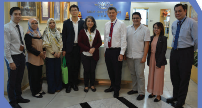
Delegates from UMS