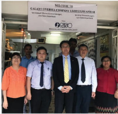
RISO Visit to Galaxy oversea office in Myanmar