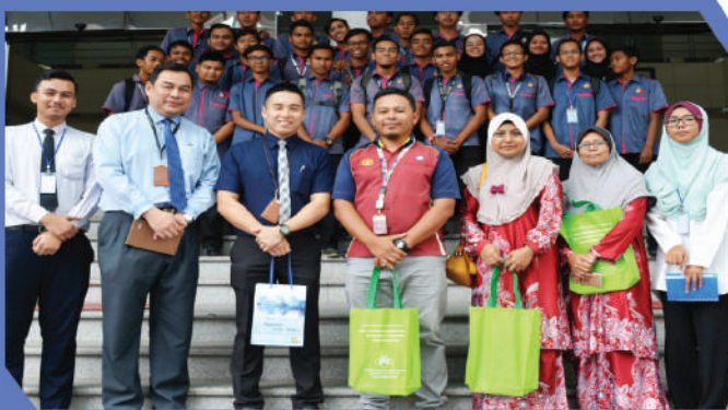
Delegates from Kolej Vokasional Lebuh Cator