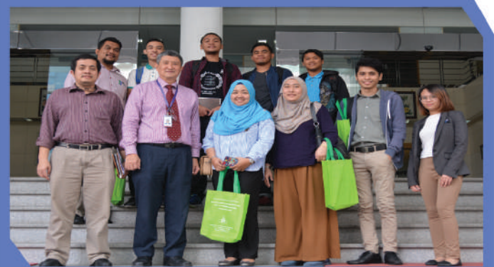
Delegates from UniMY