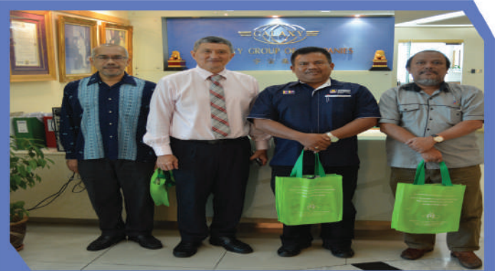
Delegates from Perpustakaan Tun Abdul Razak Universiti Teknologi MARA Selangor