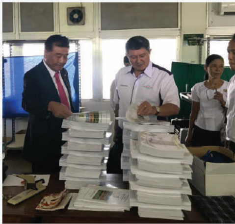
Visit to Central Agriculture Research and Training Centre