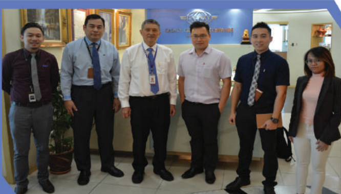
Delegates from Newline Taiwan