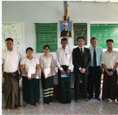
Visit to Education Office (Tharrawaddy District)