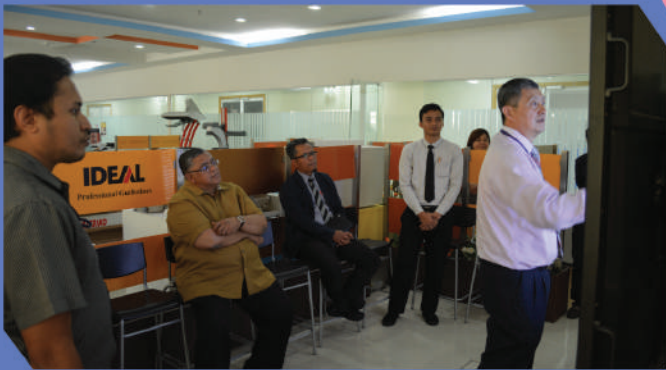
Delegates from UniSZA