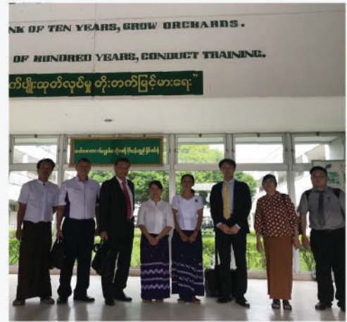
Visit to Central Agriculture Research and Training Centre