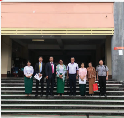
Visit to Practising High School Yangon Institute of Education (TTC)