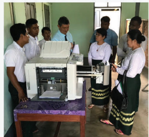
Visit to Education Office (Bago District)